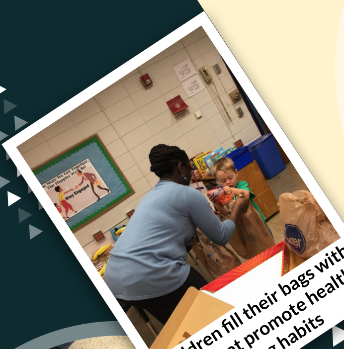
Children fill their bags with items that promote healthy eating habits