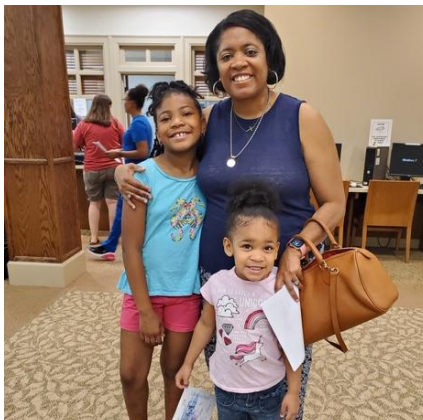
Reading and literacy support healthy child and family development

This grant is an opportunity for Twiggs County families with 2-3yr olds to prepare their children for school. Monthly sessions are held on the second Tuesday in Room 47 @ Jeffersonville Elementary School