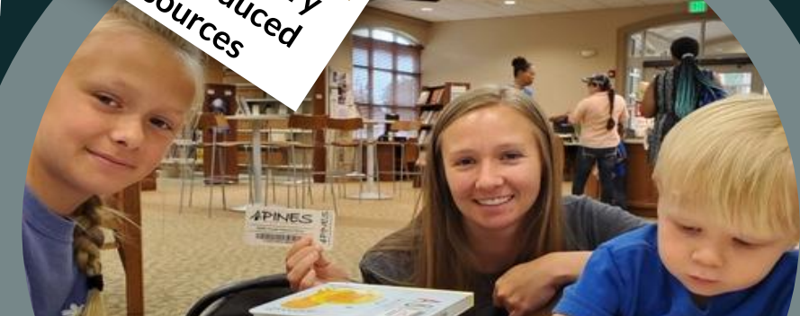
Families apply for library cards and are introduced to library resources