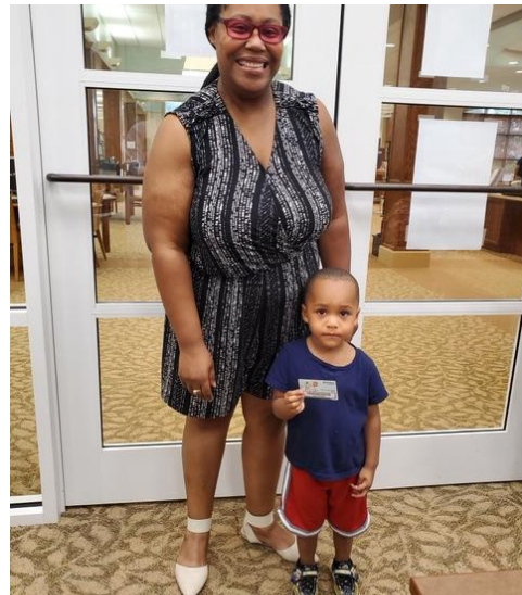
Summer sessions were held at the Twiggs Co. Public Library