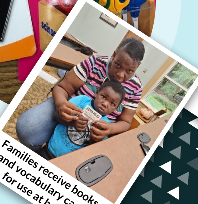
Families receive books and vocabulary cards for use at home